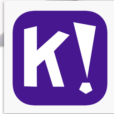
Kahoot! Game-based learning platform