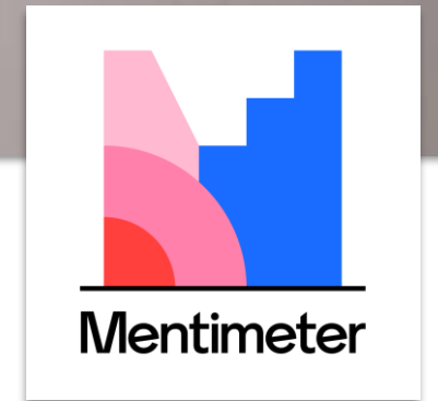
Mentimeter Interactive presentation software