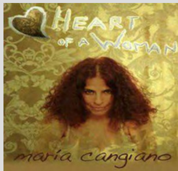
CORAZÓN DE MUJER(2012)