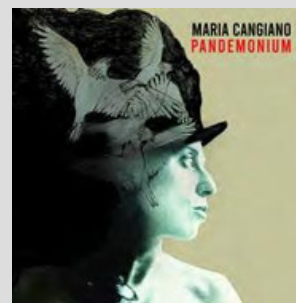
PANDEMONIUM (EPSA MUSIC: 2020)