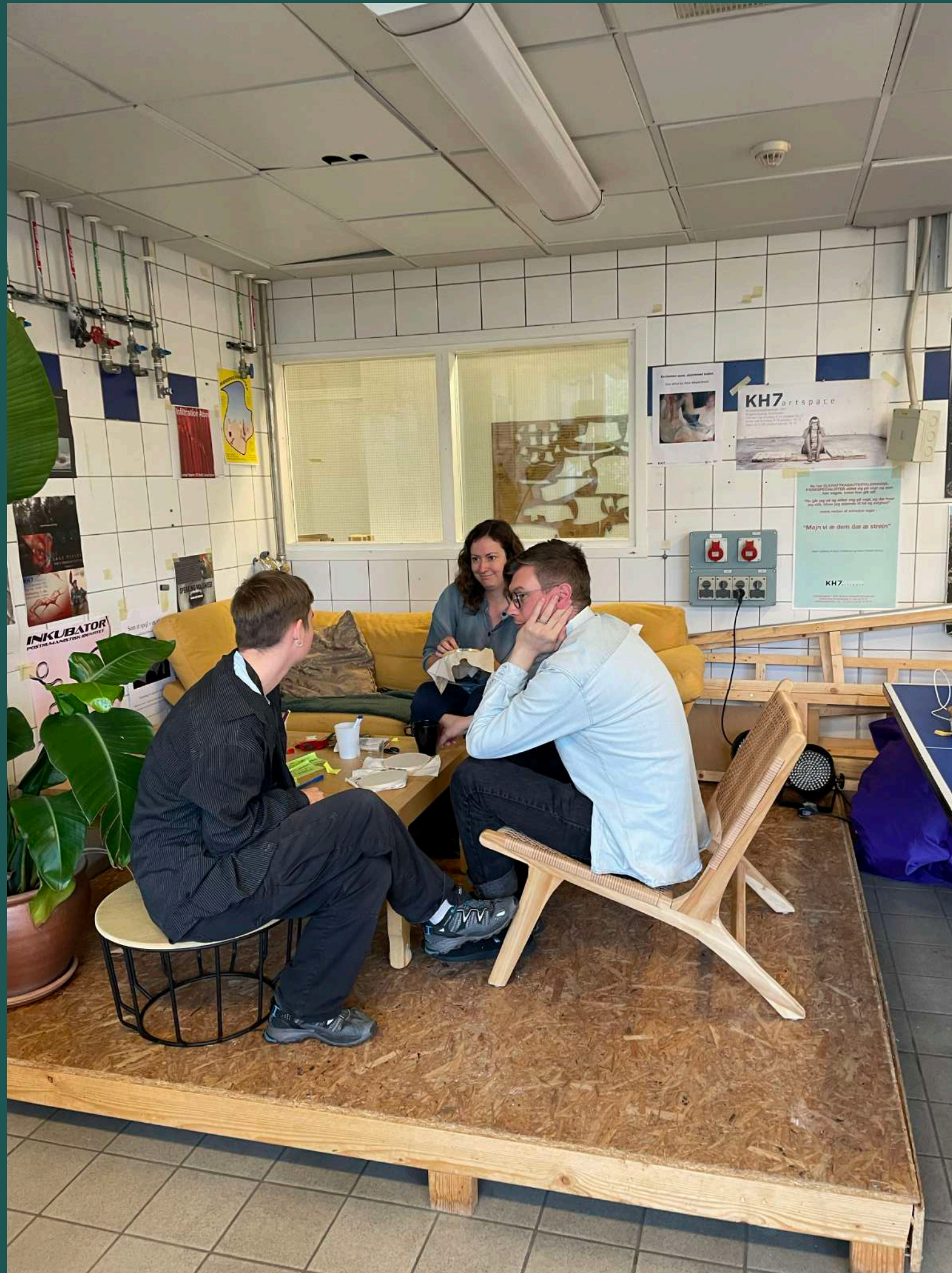
KH7, Aarhus | Denmark, 2025

All materials are provided by the facilitator.